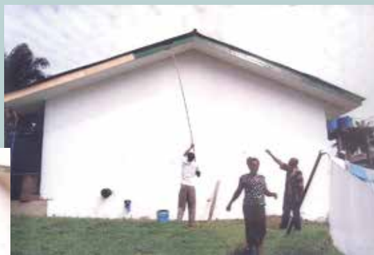
Painters at the Palmer Hospital are making good progress for such a big project.